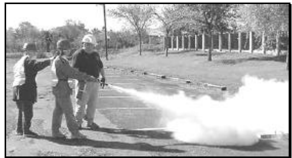
Class members learn to extinguish an actual fire during the class

guish a small fire before it becomes a large catastrophic fire? Do you know how to safely remove a victim trapped under debris? Do you know the basic first aid techniques that can save the life of a friend or family member? These questions and many more are answered in the CERT course. The emergency training that you receive will benefit you here at the college and at home.