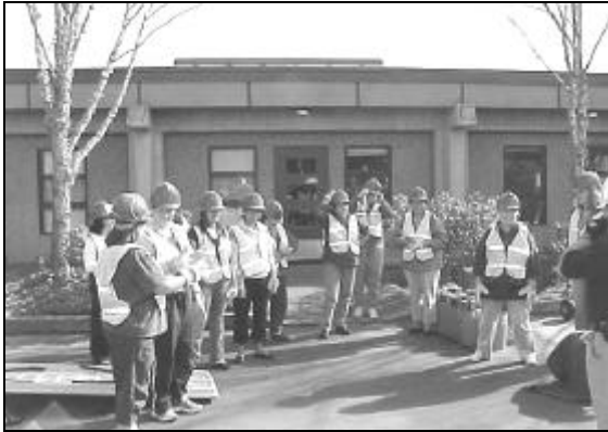
Here members of the colleges' child development center go through CERT training.

Following a major disaster, emergency responders at the college and in Napa County will not be able to meet the intense demand for help. Factors such as number of victims, communication failures, and road blockages will prevent people from accessing emergency services they have come to expect at a moment's notice through 911. The college staff will have to rely on each other for help in order to meet their immediate life saving and life sustaining needs. The college may be on its' own for several hours to several days!